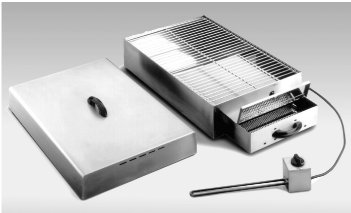
FM-2 - CORONA 120 V

Use natural sawdust, preferably beech wood, to smoke your fish (salmon, trout, eel, herring, etc.), shellfish (lobster, crawfish, mussels, etc.), meat (duck breasts, filet mignon, etc.), delicatessen (sausage, bacon, ham, etc.), vegetables and cheese at a very cost-effective price!