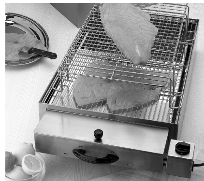
FM-4 - ROBUSTO 120 V